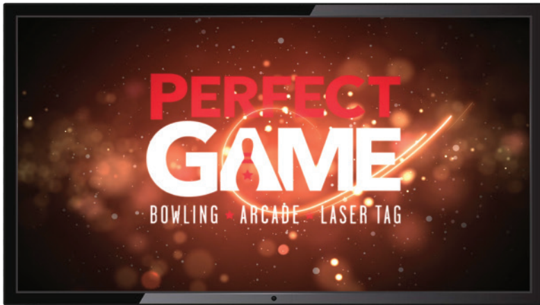
Logo Reveal Animation

“The growing popularity of platforms such as TikTok shows just how important video content is.”